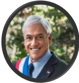
President of Chile Sebastián Piñera