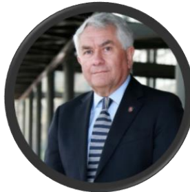
Health Minister Enrique Paris