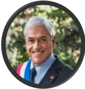
President of Chile Sebastián Piñera