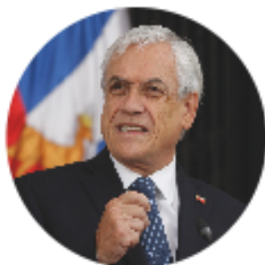
President of Chile Sebastián Piñera