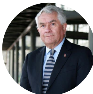
Health Minister Enrique Paris