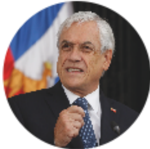
President Of Chile Sebastián Piñera