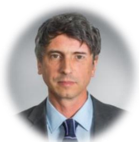
Science Minister Andrés Couve