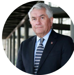
Health Minister Enrique Paris