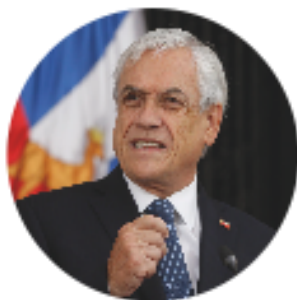
President Of Chile Sebastián Piñera